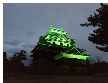
Tales from the Regions - Matsue April 8th (Thu) 19:00- @Zoom Click HERE to view the details