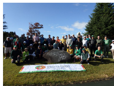
IJCC Ireland Japan Golf Challenge Ambassador's Cup 2021 Spring